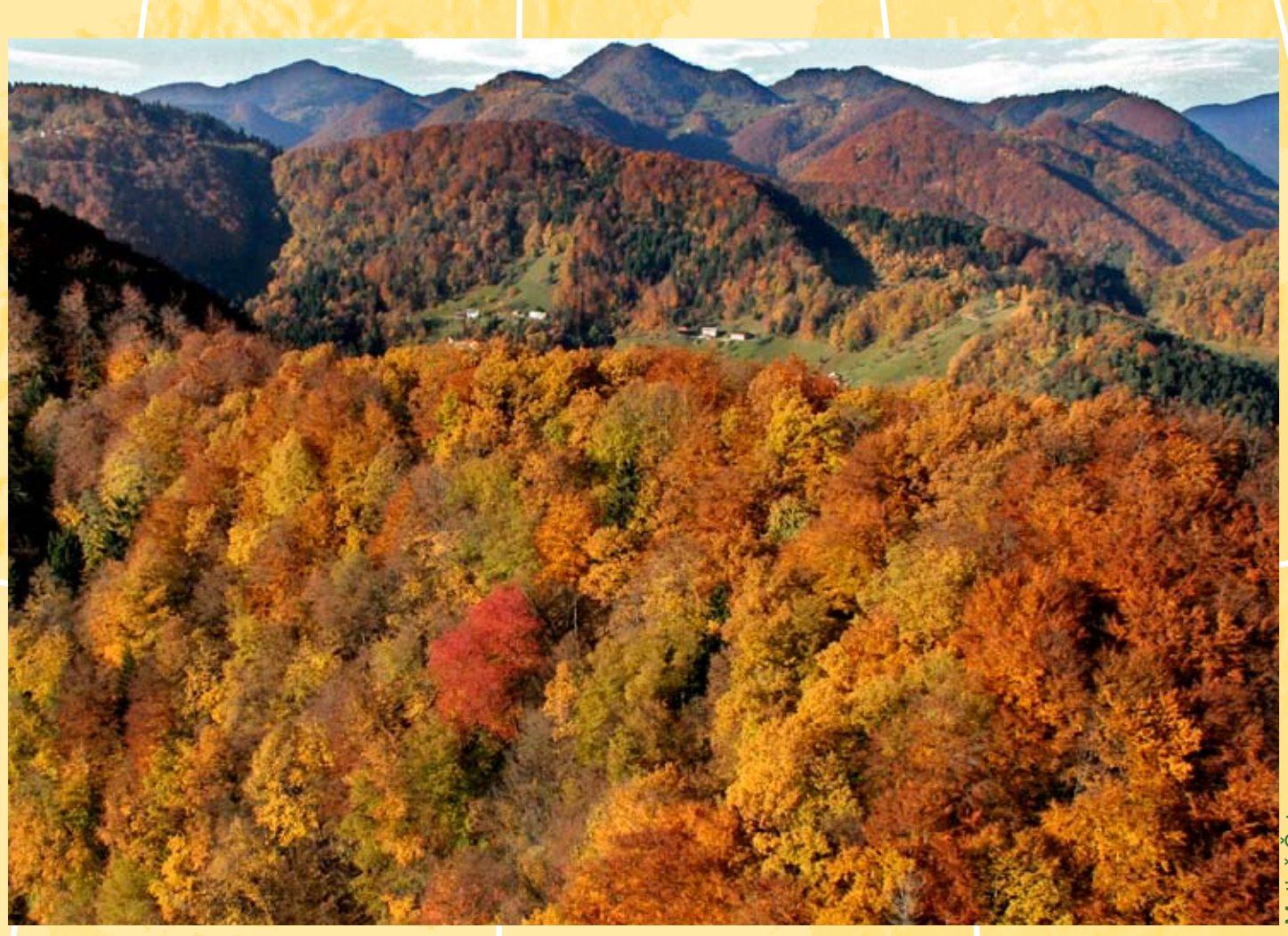
ious forest in Sloveni